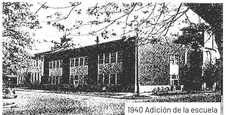
1940 Adición de la escuela

En 1945, los feligreses de Sta. Maria tenían un doble motivo de celebración. La guerra había terminado y la deuda de la iglesia estaba totalmente saldada. Además, celebraron el 25 aniversario como sacerdote de su amado pastor. Continuará