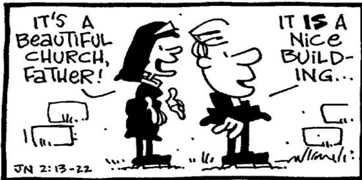
DEDICATION OF ST. JOHN LATERAN

Advent is the blessed four-week season of preparation for the coming of Jesus on Christmas Day and the anticipation of his coming again. Many observe this holy season by lighting candles each of the four Sundays in Advent. Three candles are purple, reminding us to pray and serve others lovingly to help prepare the way for Jesus. The candle for the third Sunday of Advent is rose-colored. This color symbolizes our joy as the birth of Jesus draws near. On Christmas Eve a white Christ candle is lit along with the other four. This year, advent begins on Sunday, December 1 . The St. Mary Catholic Store has 5 piece sets of advent candles in stock, inside the Parish Office on weekdays and at Higher Grounds on Sundays. Each set is $10.